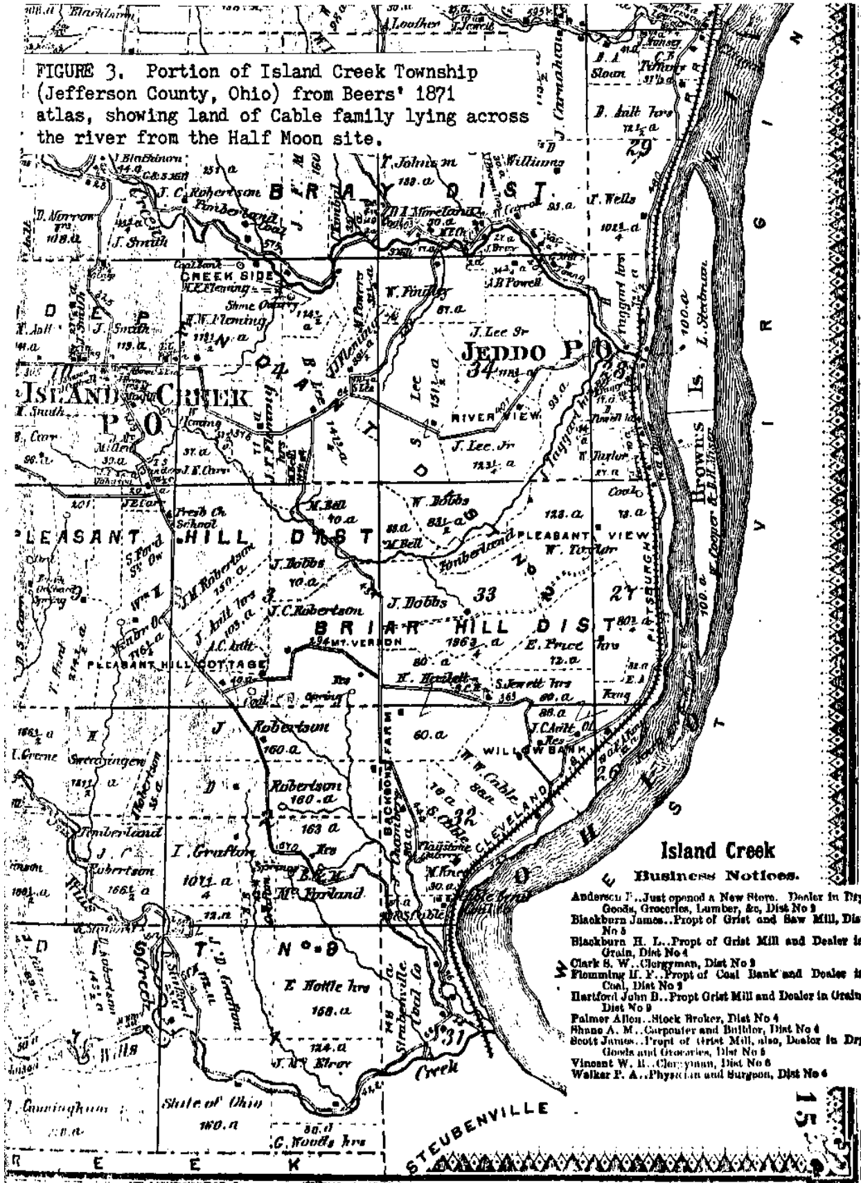
FIGURE 3. Portion of Island Creek Township (Jefferson County, Ohio) from Beers' 1871 atlas, showing land of Cable family lying across the river from the Half Moon site.